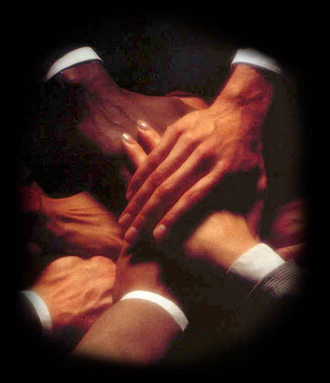
2003 Heartlight, Inc. - http://www.heartlight.org