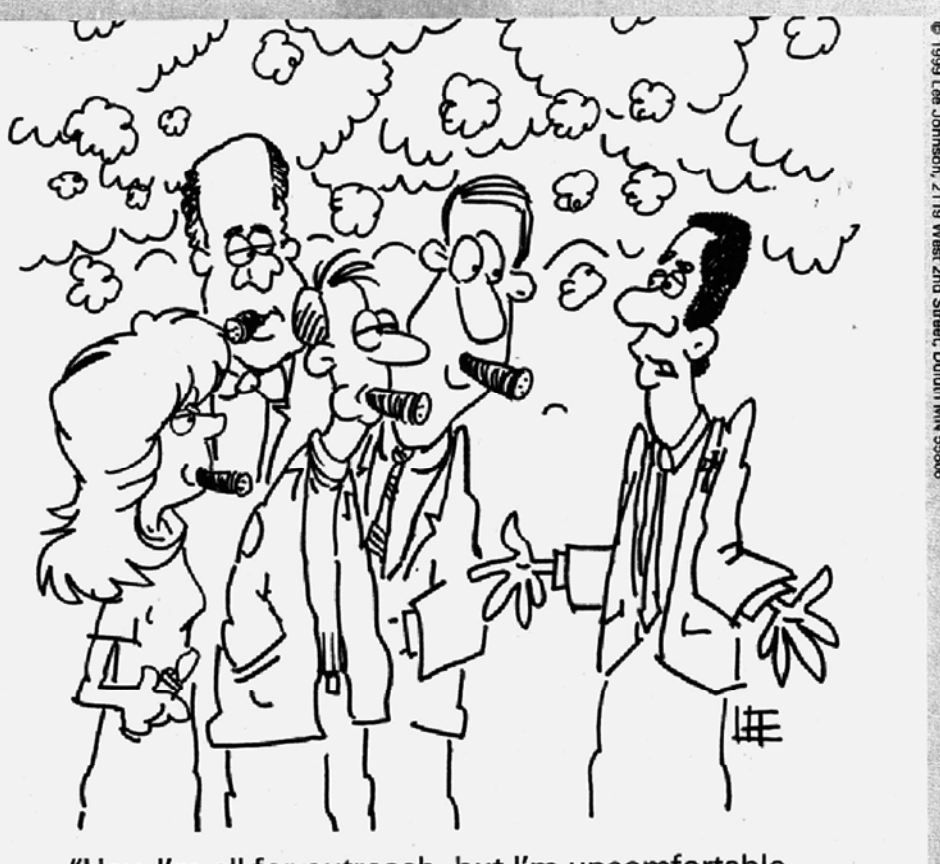
"Hey, I'm all for outreach, but I'm uncomfortable with the cigar night services."