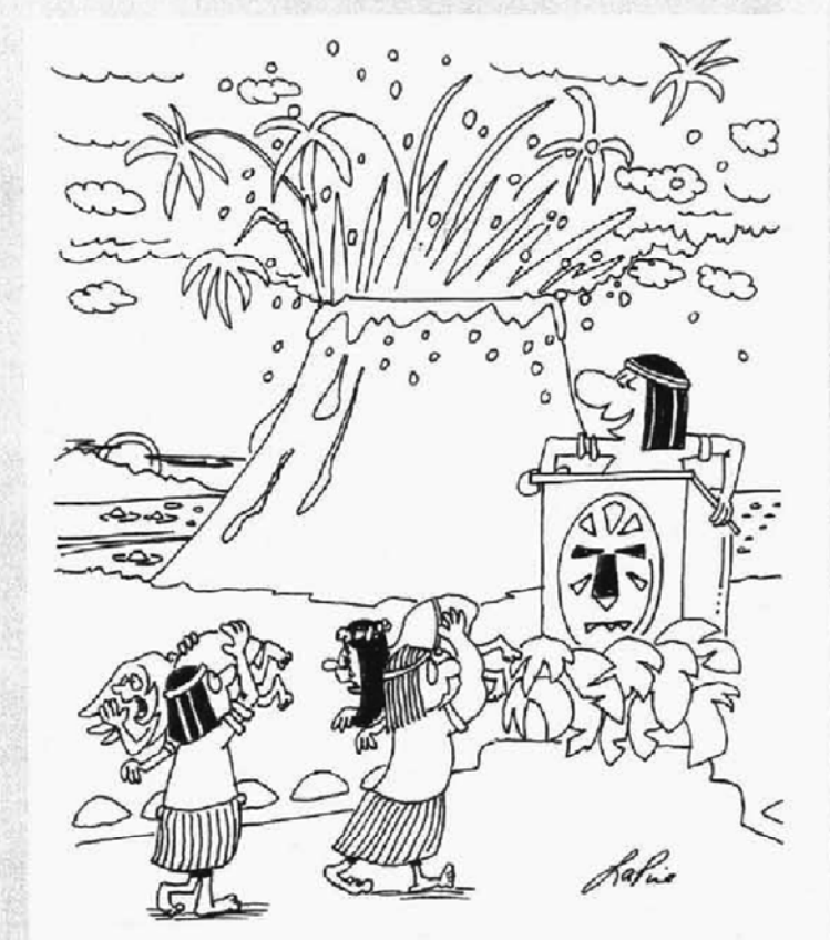
"Will the ushers please come forward for this morning's offering."