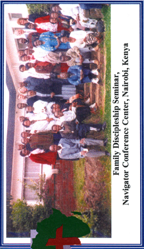
Family Discipleship Seminar, Navigator Conference Center, Nairobi, Kenya

"Therefore we ought to support such men that we might be fellow workers with them in the truth."